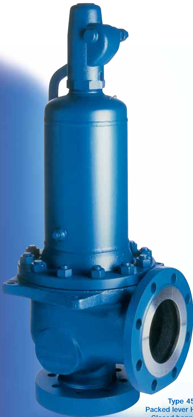
Type 456 Packed lever H4 Closed bonnet Conventional design