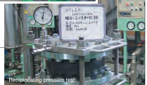
Reciprocating pressure test