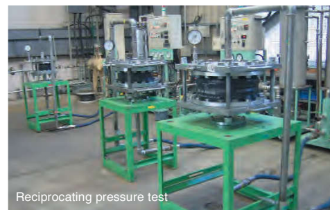
Reciprocating pressure test