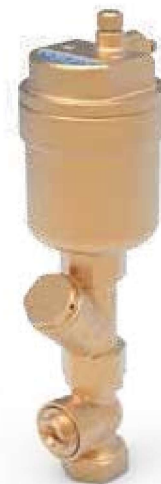
YAC-3M Type Multi-Function Air Vend (Air Vend + Strainer + Stone valve)