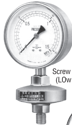
Screw fitting type (LOW pressure)